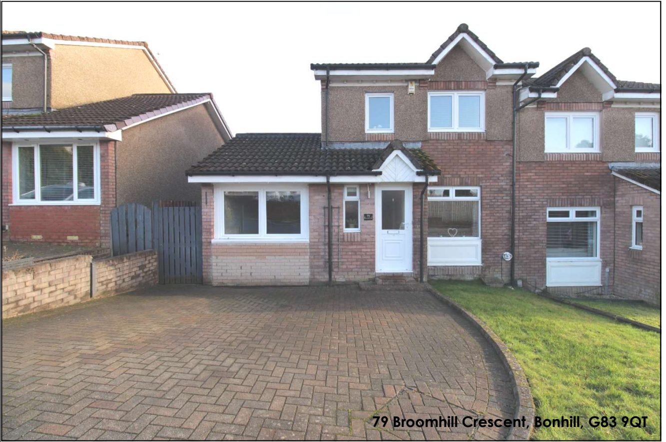
79 Broomhill Crescent, Bonhill, G83 9QT

Presented to the market in fantastic condition is this extended four bedroom semi-detached villa which is located in this established residential estate in Bonhill.